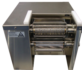
Optional Double Tenderizing